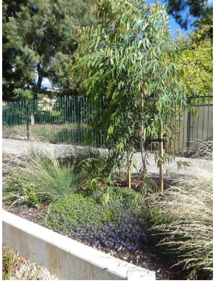
Street trees and understorey supported by stormwater runoff via infiltration wells, January 2016