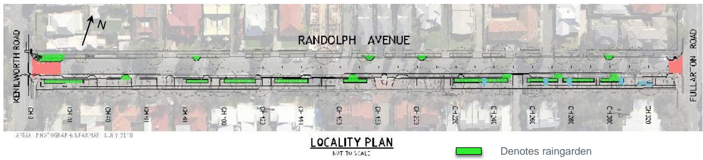
Plan view of Randolph Avenue raingarden locations