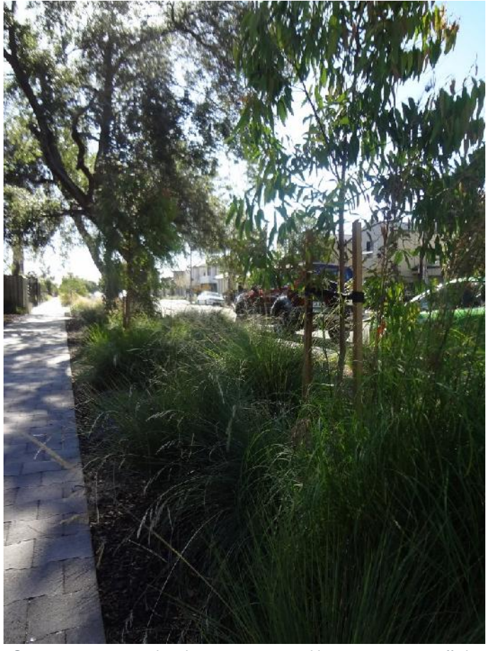
Streetscape trees and understorey supported by stormwater runoff via infiltration wells and shade of existing tree, January 2016