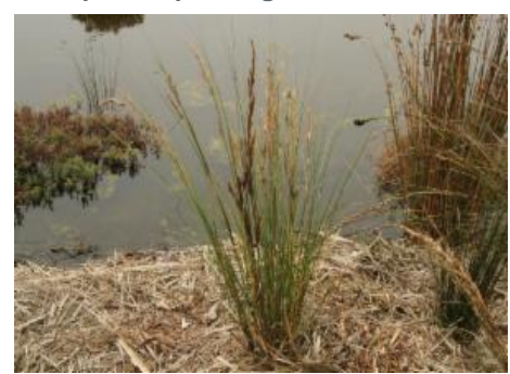
Gahna filium (Chaffy Saw-Sedge)