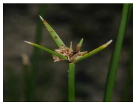
Cyperus gymnocaulos (Spiny Sedge)