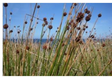
Ficina nodosa (Knobby Club Rush)