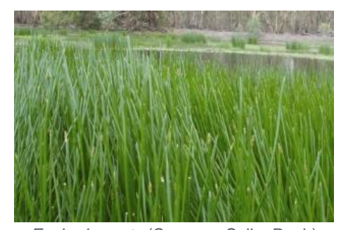
Eocharis acuta (Common Spike Rush)