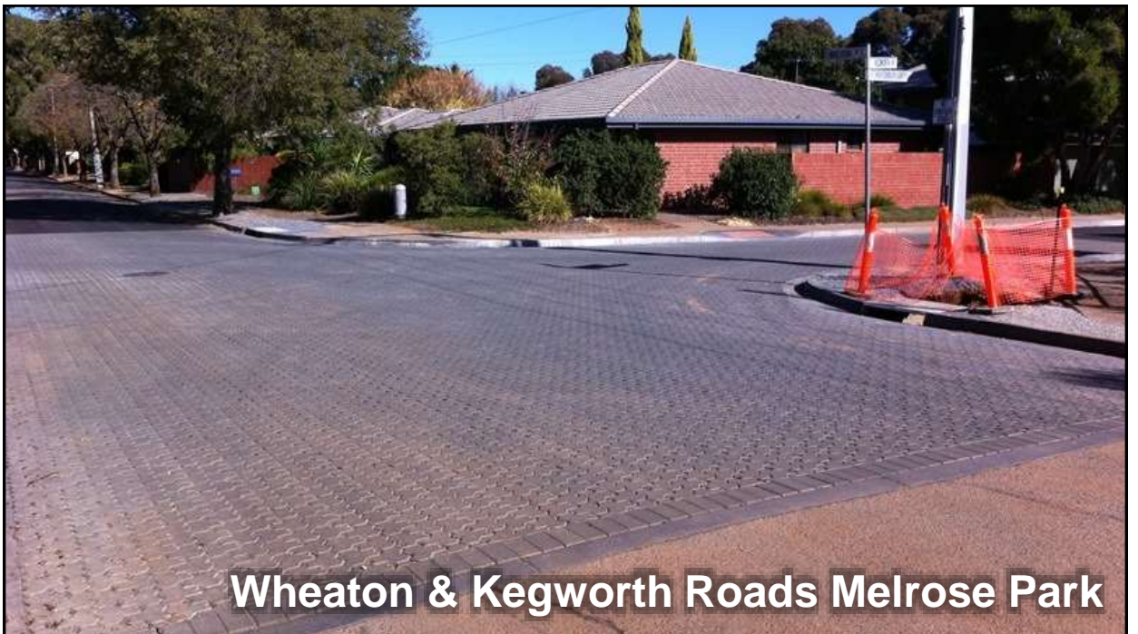
Wheaton & Kegworth Roads Melrose Park