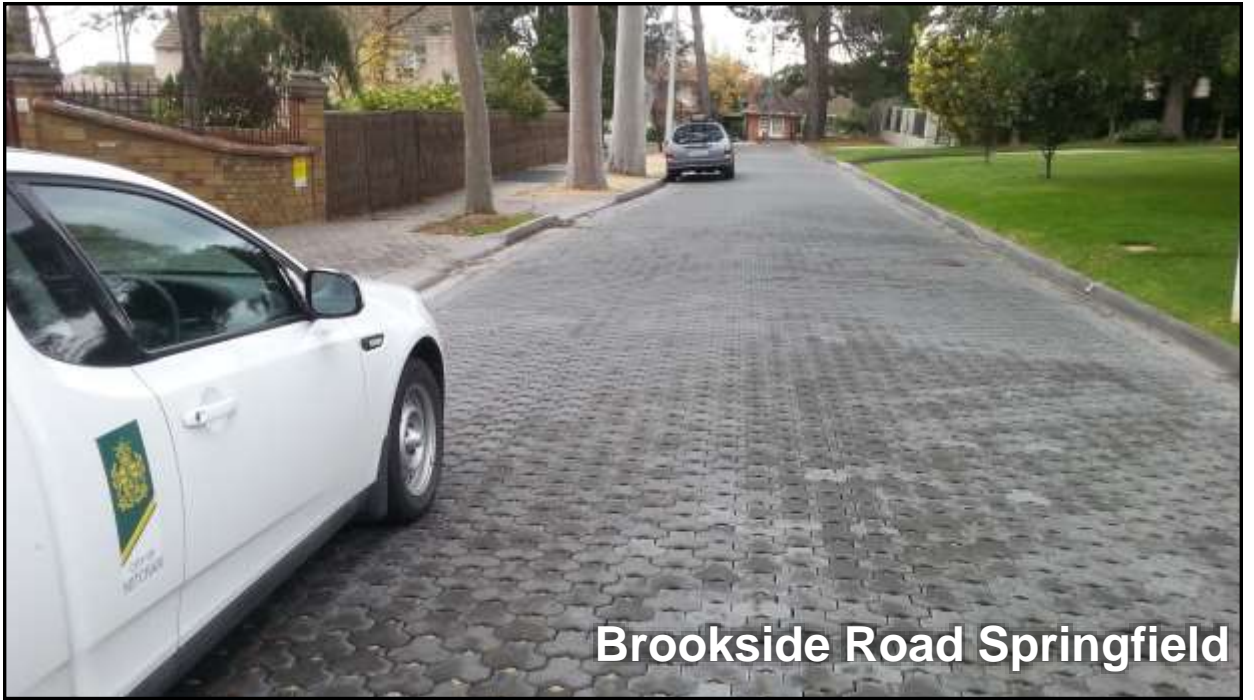
Brookside Road Springfield